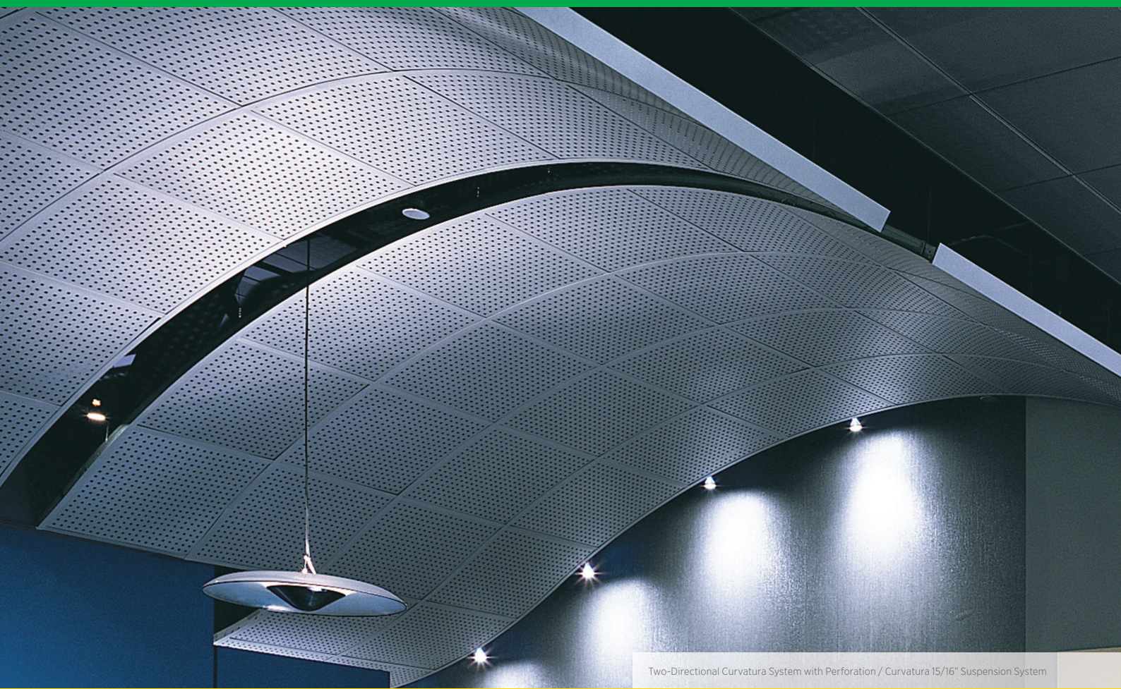
Two-Directional Curvatura System with Perforation / Curvatura 15/16" Suspension System